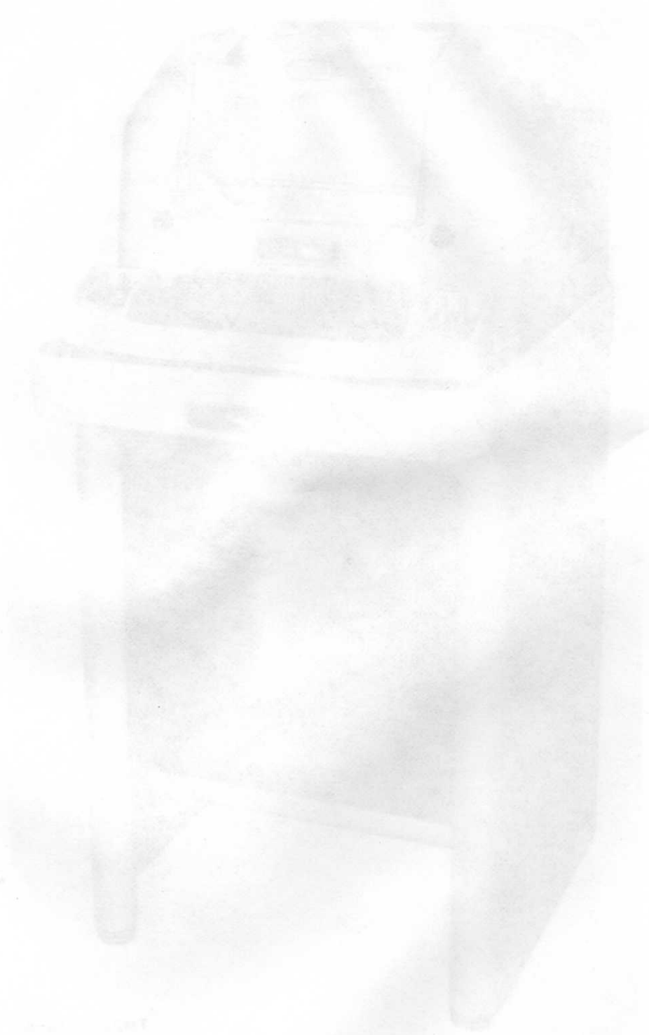
Faint, illegible text caption located below the table image.