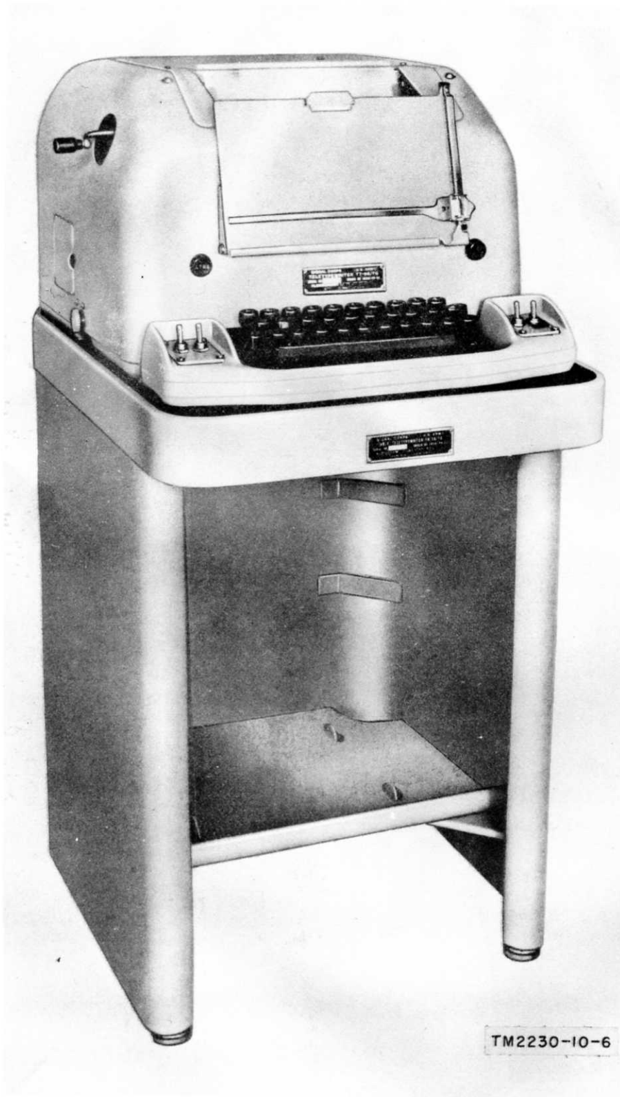
Figure 1-1. Teletypewriter Set AN/FGC-20, less running spares and technical manuals.